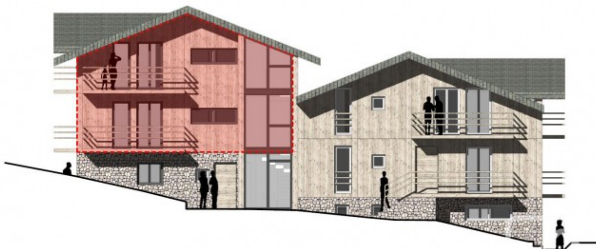
APPARTEMENT 4 DUPLEX OUEST - FAÇADE SUD