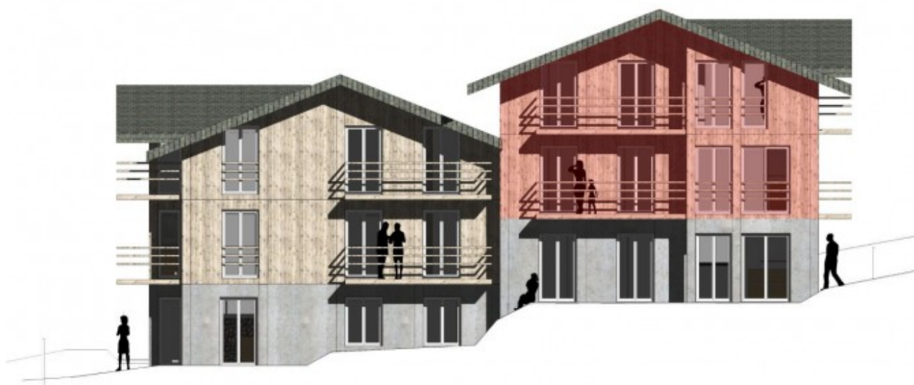
APPARTEMENT 4 DUPLEX OUEST - FAÇADE NORD